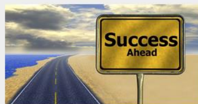
College and Career

College Assistance Plus was invited to partner with the Association of Christian Schools to help your school, and the churches you serve, equip students to thrive on secular and Christian campuses, and reduce student debt so that younger siblings can afford a Christian education --- and so college grads can start life with financial freedom. The tools on the below website have been proven in churches and schools to reverse the 70% loss to the faith during college transition, and prepare students to grow personally and positively impact secular and Christian campuses. Please review the free resources on BelieversCollegePrep.com and provide feedback to your school staff on what you find valuable. We hope that as you share this information with your friends and pastors, so that many students in your city will connect with campus ministries before they select colleges to reverse the 70% loss to the faith. This also spawns needed campus awakenings during the important first weeks on campus and breathes new life into youth groups and schools when these freshmen return for Christmas with exciting stories. The financial section, free strategy talks, and on-demand webinar will provide a fresh perspective on how to approach college, minimize debt, and reduce costs even if your income is too high. Fee-based services are available for families who wish have continual help through high school, college, grad school, and job acquisition.