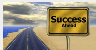
College and Career

College Assistance Plus was invited to partner with the Association of Christian Schools to help your school, and the churches you serve, equip students to thrive on secular and Christian campuses, and reduce student debt so that younger siblings can afford a Christian education --- and college grads can start life with financial freedom. The tools on the below website have been proven in churches and schools to reverse the 40-80% loss to the faith during college transition, and prepare students to grow personally and positively impact secular and Christian campuses. Please review the free resources on BelieversCollegePrep.com and provide feedback to your school staff on what you find valuable. We hope that as you share this information with your friends and pastors, so many students in your city will connect with campus ministries before they select colleges or leave home to reverse the 70% loss to the faith. This also spawns needed campus awakenings during the important first weeks on campus . The financial section, free strategy talks, and on-demand webinar will provide a fresh perspective on how to approach college, minimize debt, and reduce costs even if your income is too high. Fee-based services are available for families who wish have continual help through high school, college, grad school, and job acquisition.